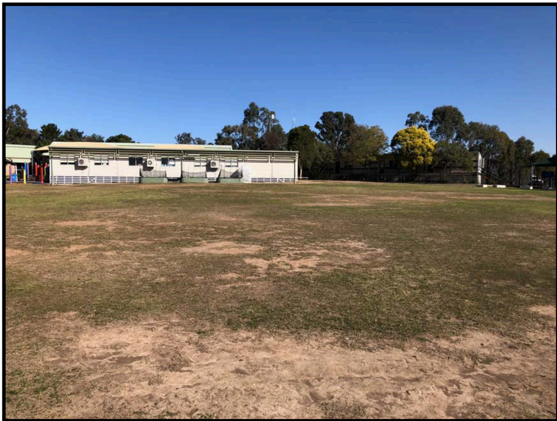
Photograph 2 – Photograph showing location for building

The purpose of the building is to provide additional classroom space for the school. No increase in student numbers is proposed as a consequence of the construction of the proposed building. As such, the current capped student level of a maximum of 740 students will not be exceeded.