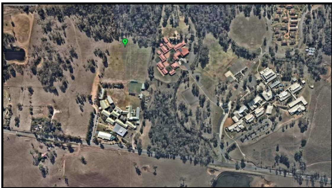
Photograph 1 – Aerial Photograph of Site & Locality

The existing school was approved by Council in 1985 under Consent No.56/85. Development Application 71/90 was approved which included the construction of additional classrooms, toilets, staff rooms etc. and increased the number of students capped at 740. Consent No. DA14/0224 was approved by Council in March 2014 for a new Senior Studies Building for Year 11 & 12 Students. At the time the school had 467 students enrolled. The new senior school block allowed an increase of 120 students plus staff with an expected capacity of 600 students.